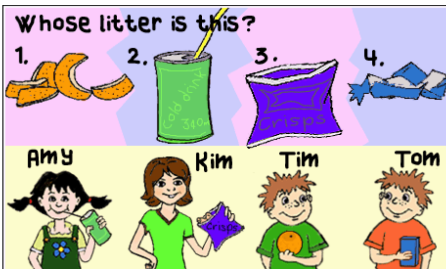
Figure 5: 1IR24.GIF

Questions 8 to 10 refer to the following graphic