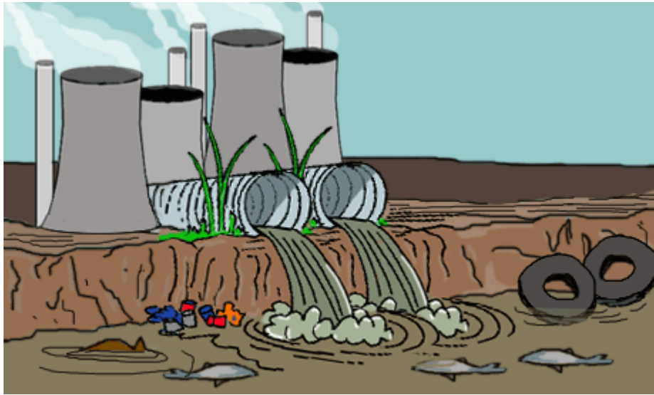
Figure 2: 2NV44.GIF