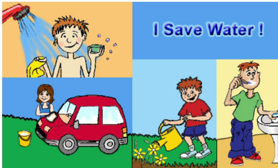
Figure 3: 1MC58.BMP