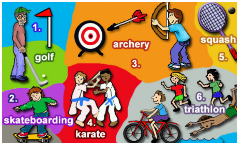
Figure 5: 3MC68.BMP

Question 10 refers to the following graphic