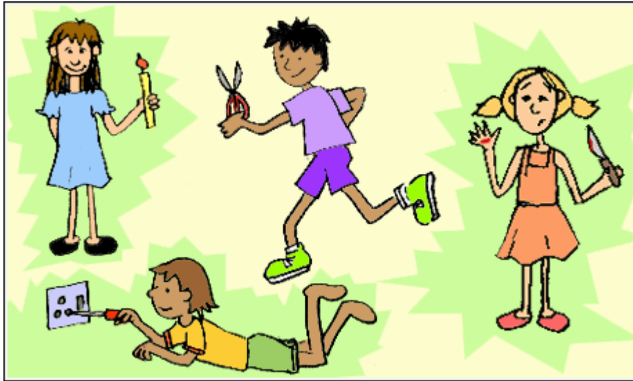
Figure 1: 2NV16.GIF

Questions 1 to 3 refer to the following graphic