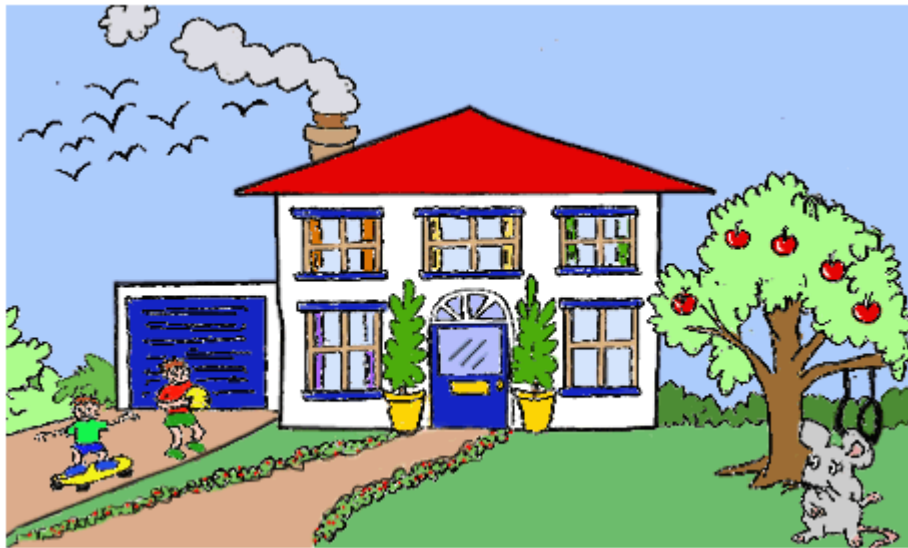
Figure 4: 2VZ3.GIF