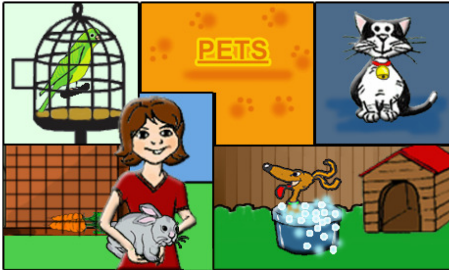
Figure 4: 3MC63.BMP

Question 10 refers to the following graphic