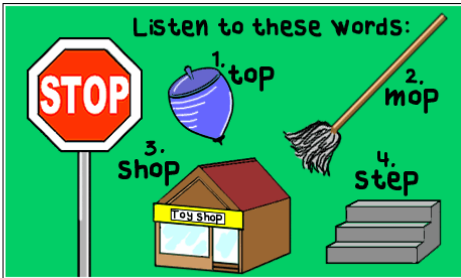
Figure 2: 1IR31.GIF