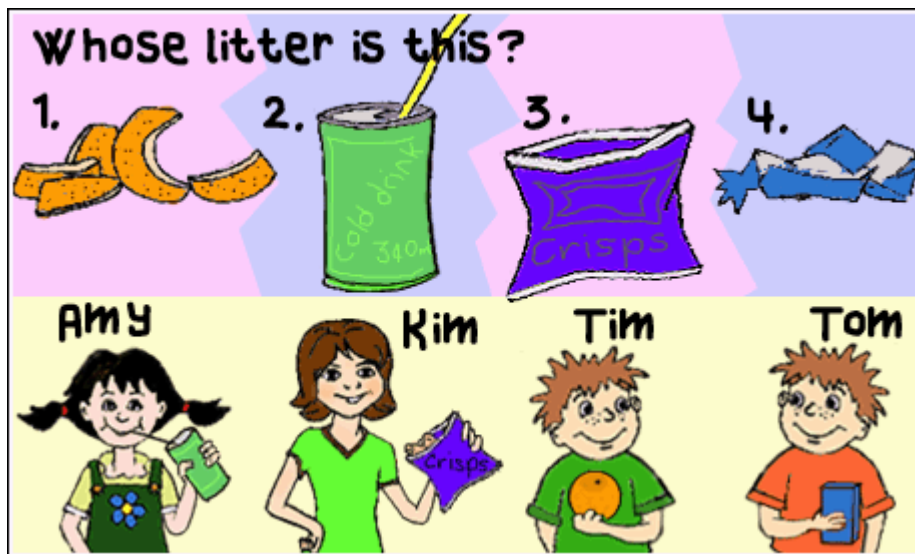
Figure 6: 1IR24.GIF

Question 9 refers to the following graphic