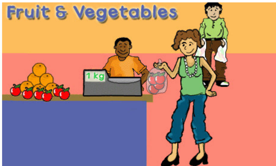
Figure 7: Fruit & Veg