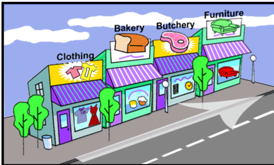
Figure 3: Shops l to r

Questions 4 to 6 refer to the following graphic