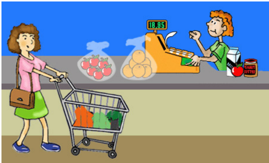
Figure 4: Shopping till

Question 7 refers to the following graphic