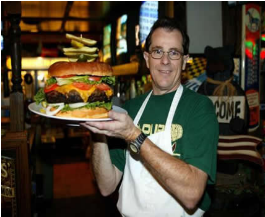
Figure 3: Bitmap