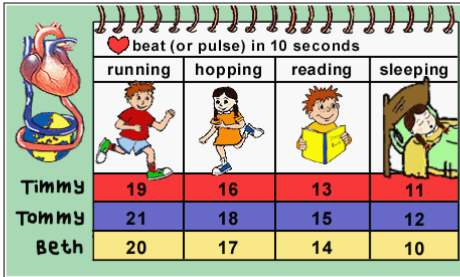
Figure 1: 3DH21.GIF

Questions 1 to 4 refer to the following graphic